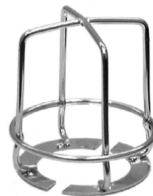
Dry Sprinkler Guard (Order sprinkler guard separately from sprinklers.)