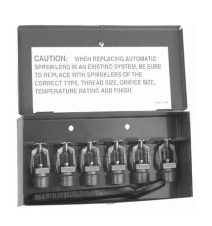
Figure 2: Sprinkler Cabinet 01724A (Sprinklers and wrench not included)

sprinklers and wrench inside cabinet. (12-head cabinet shown)