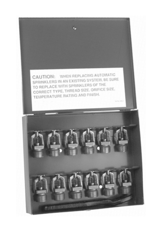
Figure 3: Sprinkler Cabinet 01725A (Sprinklers and wrench not included)

Figure 2: Sprinkler Cabinet 01724A (Sprinklers and wrench not included)